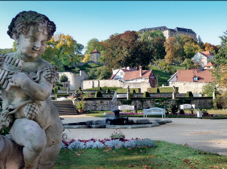
Castle view from the Baroque Gardens

The town of Blankenburg is located in the heart of the administrative district Harz. Not far from which side or how one comes to town, Blankenburg Castle can be beheld. It is monumentally located at an altitude of 337 meters (sea level) above the town and is widely visible in the northern countryside of the Harz Mountains.