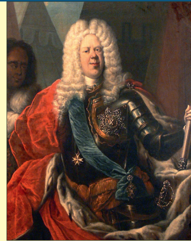
Duke Ludwig Rudolf

The Wealth of great architecture at the castle suffered somewhat due to its being left vacant from 1992. The nonprofit organization Save Blankenburg Castle is striving since 2005 to preserve the threatened monument, which is still at an acute risk in many places – especially due to infestation with dry rot.